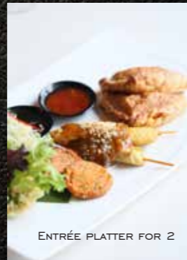
ENTRÉE PLATTER FOR 2