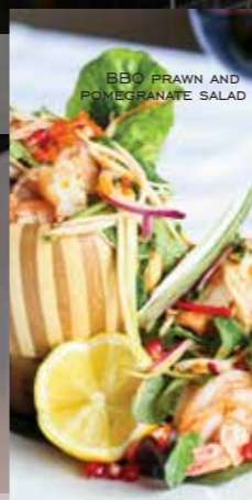
BBQ PRAWN AND POMEGRANATE SALAD