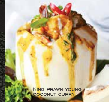
KING PRAWN YOUNG COCONUT CURRY

MARINATED PORK NECK SERVED WITH SPECIAL BARLAME TAMARIND SAUCE