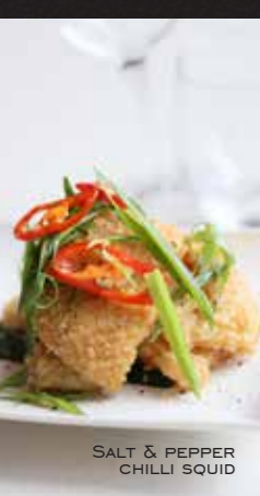
SALT & PEPPER CHILLI SQUID